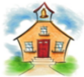
Middle School 1