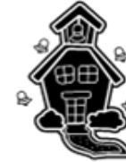
Middle School 3