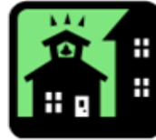
Middle School 2